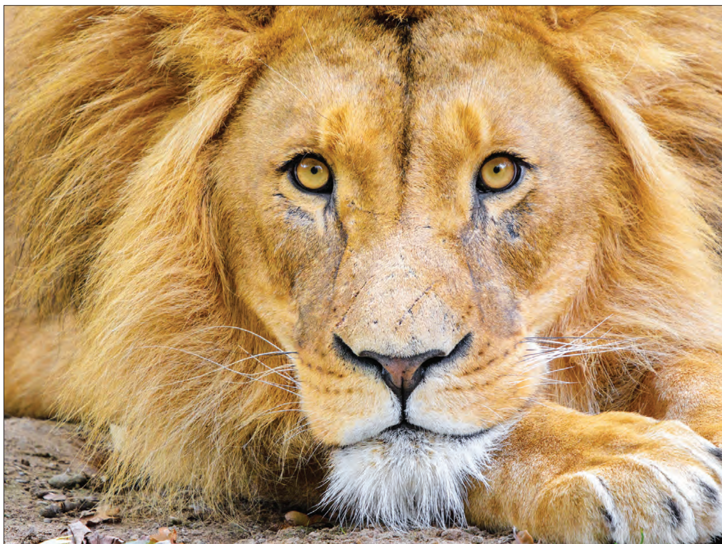
Highlands East is preparing an exotic animal bylaw.

"My last dog who just died in June was a hybrid and I wouldn't have been allowed