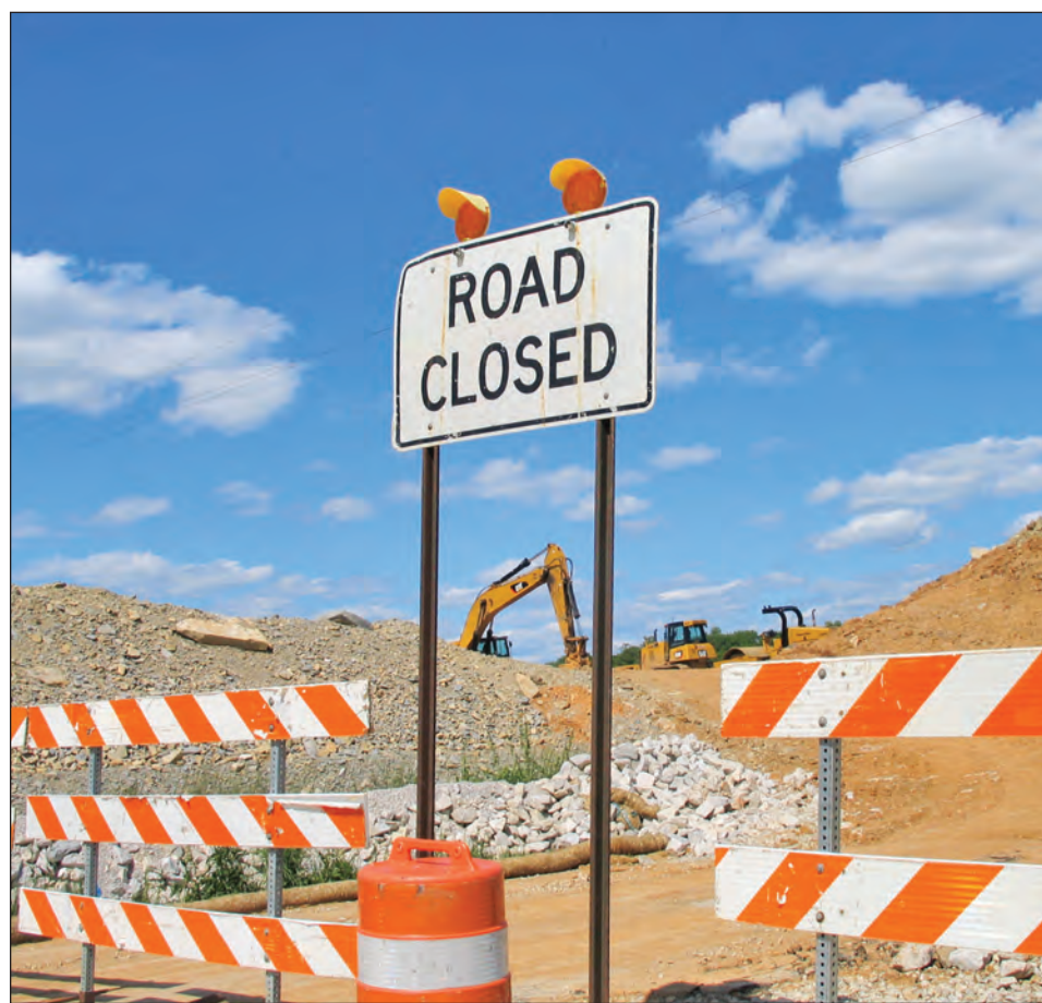
County council agreed to start work on joint purchasing of goods and services, such as contracts and road salt.

"We definitely need to agree on an approach and what those, maybe one or two low-hanging fruit pieces are," he said. "That aren't going to create a massive workload for any specific individual."