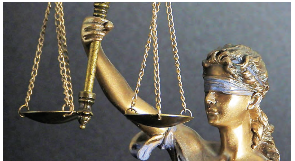
An image of the Scales of Justice. Flickr.

However, she said that one of the biggest challenges with drugs is recidivism, or