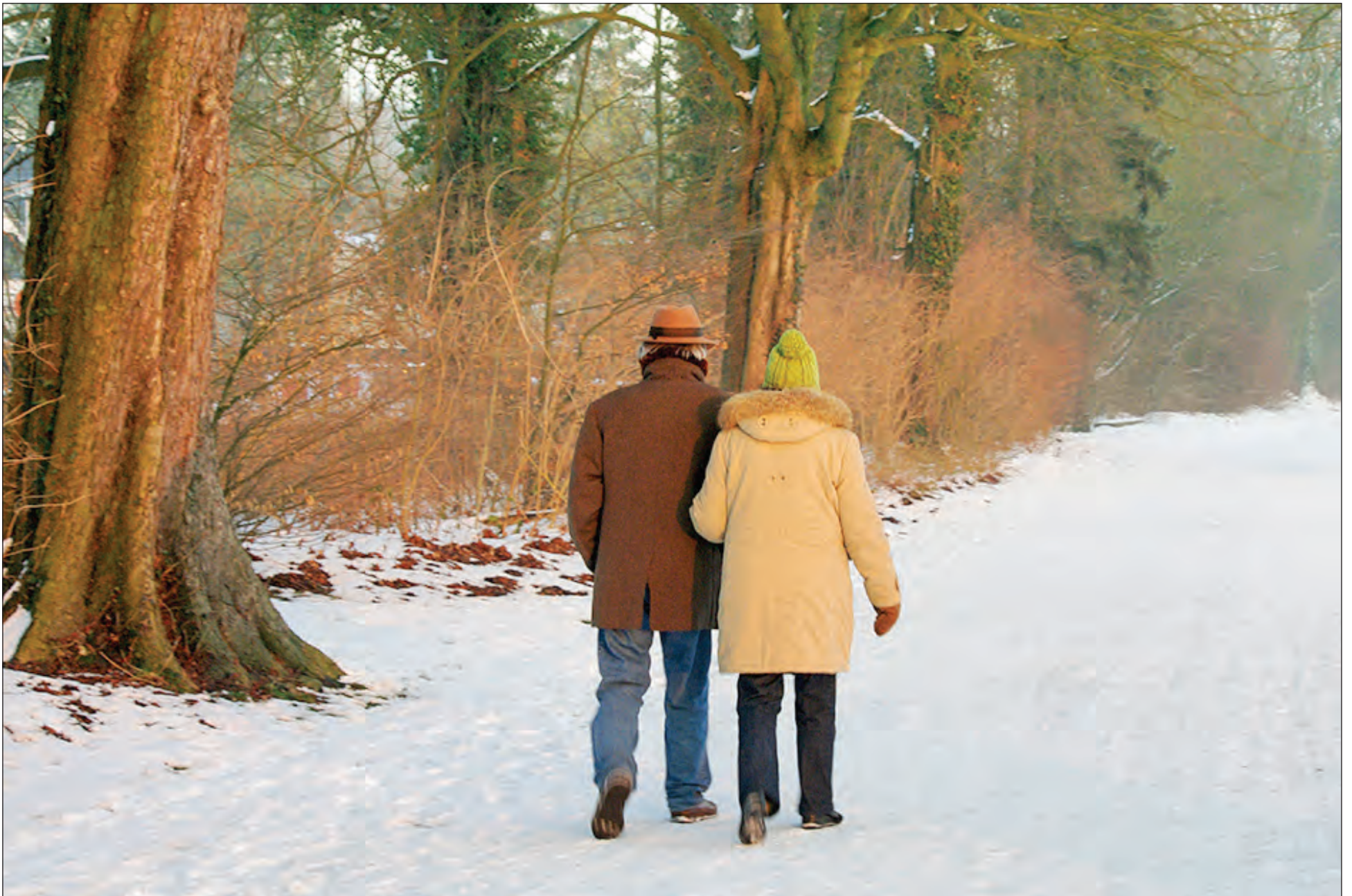
Aging Well Haliburton County is promoting safe walking.