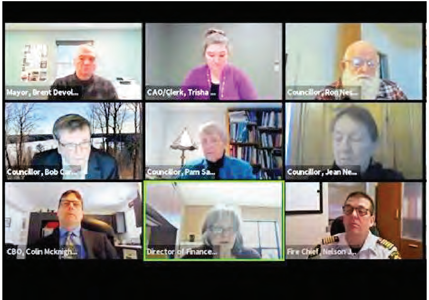
Minden Hills budget standing committee met Jan. 14.

For more information: www.haliburtonchamber.com