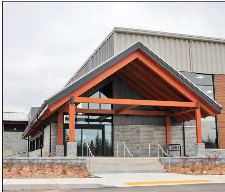
The S.G. Nesbitt Memorial Arena and Community Centre remains empty. File photo.

Council also discussed inclusions of volleyball lines for the gym floor ($1,800), finishing and sealing the concrete floors in the stands and upper arena public