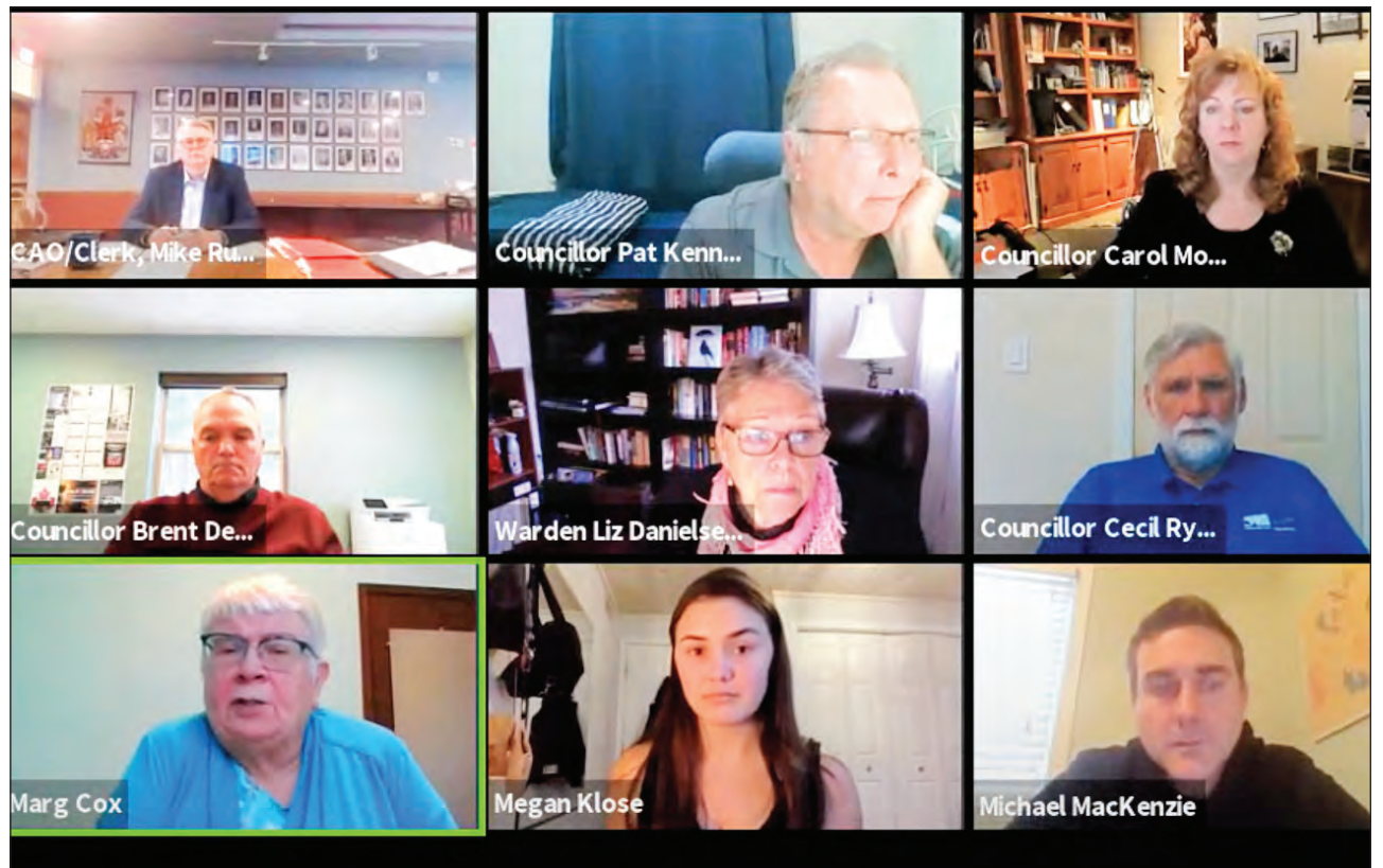
A delegation presented to County council about youth connectivity Jan. 13.