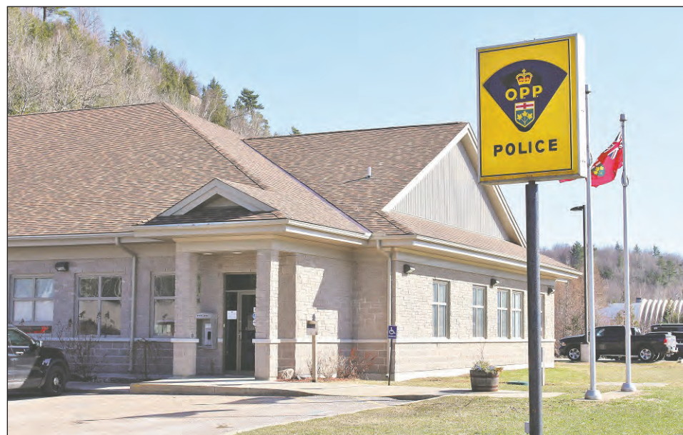
OPP have begun enforcing a new stay-at-home order but said it is focused on gatherings rather than individuals. File photo.

another residence if they intend to be there for less than 24 hours and are attending for an essential purpose; or if they intend to reside there for at least 14 days.