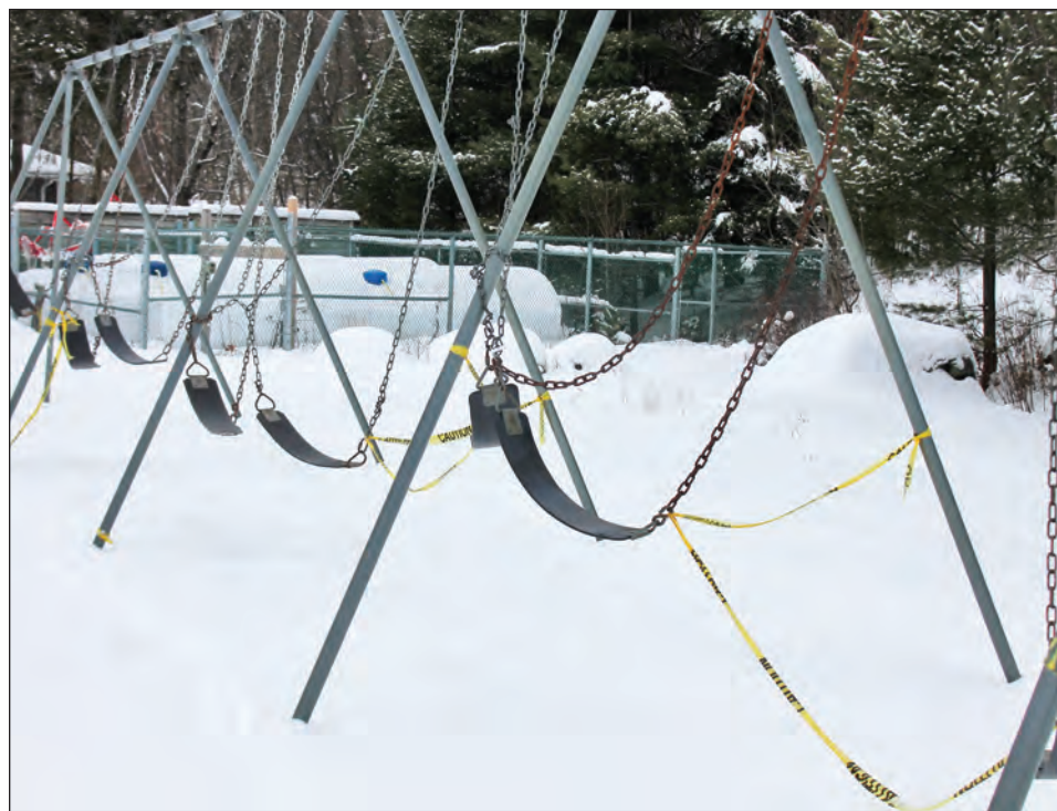
Local school playgrounds remain empty.

"Students are finding themselves unmotivated and overwhelmed. They are overstressed. There is too much material coming at them and too little time to do it," Kelly said. "Many are facing five-plus hours on-line with three full lessons and