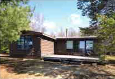
KENNISIS LAKE $529,000

100 ft of SW frtg. 3 lake chain for 35 m of boating. 3 BR plus den/office, cozy wood stove, propane furnace, over sized garage, shed, & Bunkie. Gently sloping lot, clean sandy shoreline. Beautiful sunsets!