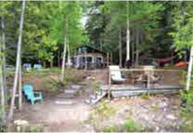
ROSS LAKE - $524,900

Just minutes to Haliburton village from this home or cottage. Open concept with upper level BR's, bath & loft space. Renovated lower level as separate living space. Beautiful views from multi-level decks & 3 season room. Miles of boating & fishing.