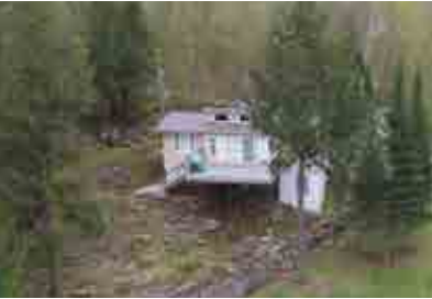
LITTLE BOB LAKE $449,900

Traditional 2BR cottage close to the shore. Beautiful open view, rock & sand shoreline w/deck & dock. Level lot. Well maintained, furnished, yr rnd road. Move in and enjoy!