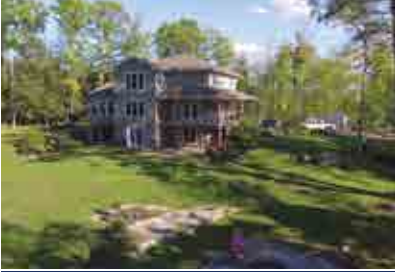
OSPREY ROAD - $649,000

Magnificent flat lot, sand beach with gradual entry, stonework at the shoreline and fantastic N/W exposure. Triple bay garage with storage loft near completion and a classic 3BR cottage to upgrade and finish to your vision.