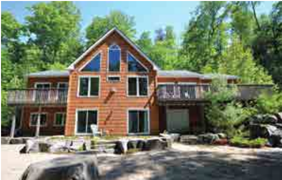
DRAG LAKE! $919,000

Beautifully designed 4 Bdrm. 164 Ft. Shoreline. Professionally landscaped. Open concept design. Vaulted ceiling & Brick Propane FP. Chef's Kitchen, Lakeview Diningroom. Separate Familyroom & Screened Sunroom. Spacious Loft Area. Propane Furnace, Attached Garage, Fully Tastefully Furnished & Truly Magnificent!