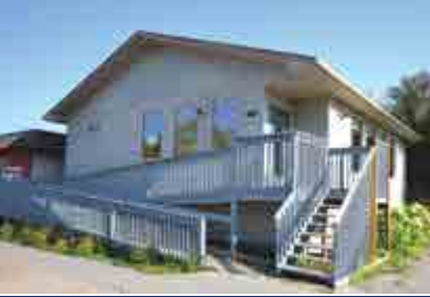
VICTORIA STREET COMMERCIAL $359,000

4BR cottage can be used year round. Nestled on Canadian shield rock in a quiet bay with a beautiful view down the lake, lots of upgrades, 2 sunrooms, raised deck. Detached garage. Turn key cottage at a great price.