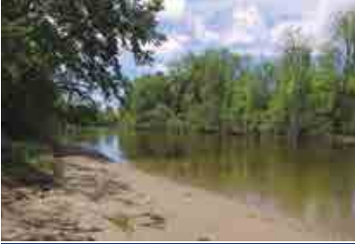
GULL RIVER $149,900

29 acres of privacy overlooking Soyers Lake, this large custom built home enjoys over 4000sqft of living space on 3 levels with an attached over sized dbl garage. Landscaping, gardens and forest privacy.