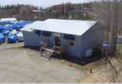
INDUSTRIAL PARK $349,000 +HST

This 2 bed, 1 bath northern getaway is located on over an acre of land and has been completely renovated for four season use, and accessible year round. Gourmet IKEA kitchen, newer windows and sliding door, drilled well, 16 x 8 floating dock, and so much more! Over 200 ft of sand shoreline. Great rental income.