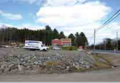
COMMERCIAL LOT $229,000+HST

Prime waterfront "In town" commercial opportunity! 1500 sq ft building. Newly renovated with kitchen, 2 pc. Open concept design with picturesque views of the Drag River & the park. Lots of parking. Wheel chair accessible. Town sewers! Drilled well! Level lot! Lots of opportunities.