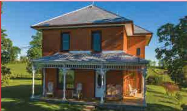
2410 6th Line N Norwood $1,198,000 100+ acres | Farm and Barns | Renovated