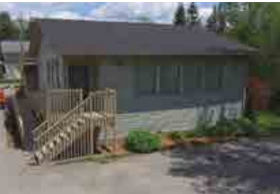
VICTORIA STREET COMMERCIAL $359,000

4BR cottage can be used year round. Nestled on Canadian shield rock in a quiet bay with a beautiful view down the lake, lots of upgrades, 2 sunrooms, raised deck. Detached garage. Turn key cottage at a great price.