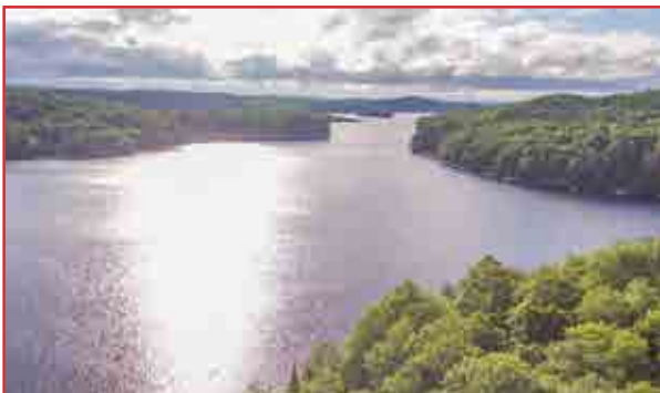
20 Port Vernon Lane $450,000 Building lot on Lake Vernon | Sand waterfront Expansive Views