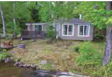
DRAG LAKE $469,000

120' Frtg / Yr Rnd Private Rd / Sandy Clean Riverfront / Hydro Available / Boat to Gull Lake