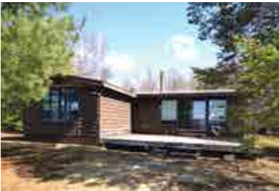
KENNISIS LAKE $529,000

100 ft of SW frtg. 3 lake chain for 35 m of boating. 3 BR plus den/office, cozy wood stove, propane furnace, over sized garage, shed, & Bunkie. Gently sloping lot, clean sandy shoreline. Beautiful sunsets!