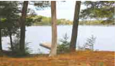
KENNISIS LAKE Build your dream cottage on this well treed prime waterfront building lot with 118 ft of frontage, sandy area for swimming. Great views! MLS 197248 | $419,000