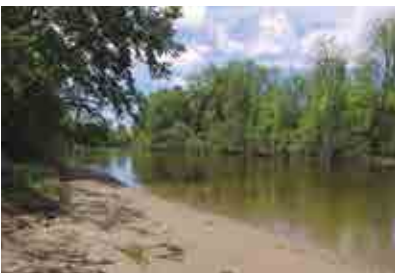
GULL RIVER $149,900

29 acres of privacy overlooking Soyers Lake, this large custom built home enjoys over 4000sqft of living space on 3 levels with an attached over sized dbl garage. Landscaping, gardens and forest privacy.