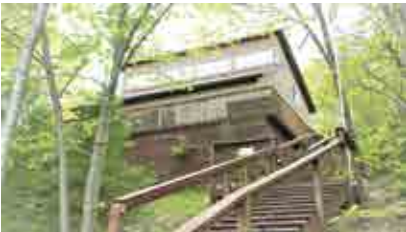
LITTLE BOB LAKE 4 season cottage with 3 bedrooms + 2 baths. Many recent upgrades throughout. located only 2 hours from the GTA MLS 201074 | $399,000

Contact us today for a free, no obligation, opinion of value.