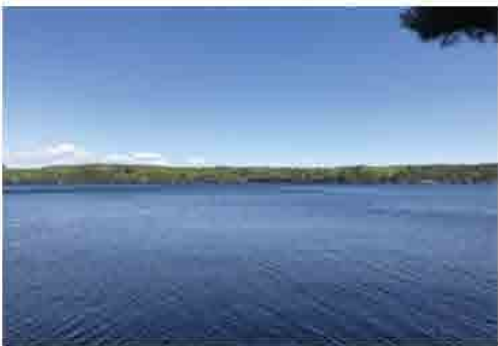
12 Mile Lake - $339,000

This is a great location for a year round waterfront home or cottage. 3 bedrooms, 2 full baths, 45x13 lakeside deck with hot tub, oversized dbl garage, great lake views, private lot, easy access off a municipal road, close to amenities in Minden and MORE! Don't miss your chance.