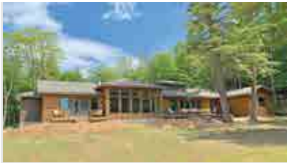
KUSHOG LAKE Newly constructed 3,480 sq. ft. 3 bedroom + den, 2 1/2 bath executive cottage w/ 30 acre lot, SW exp and gorgeous views! MLS 205927 | $1,385,000