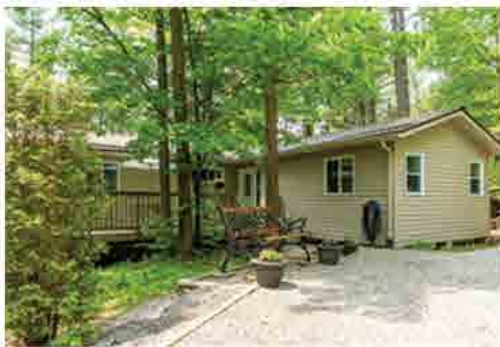
Clear Lake - $599,900

This is a great location for a year round waterfront home or cottage. 3 bedrooms, 2 full baths, 45x13 lakeside deck with hot tub, oversized dbl garage, great lake views, private lot, easy access off a municipal road, close to amenities in Minden and MORE! Don't miss your chance.