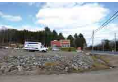
COMMERCIAL LOT $229,000+HST

Prime waterfront "In town" commercial opportunity! 1500 sq ft building. Newly renovated with kitchen, 2 pc. Open concept design with picturesque views of the Drag River & the park. Lots of parking. Wheel chair accessible. Town sewers! Drilled well! Level lot! Lots of opportunities.