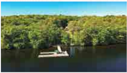
REDSTONE LAKE Arts and crafts designer 3 bedroom + 5 baths home or cottage with superb attention to detail, extremely private, double garage w/loft. MLS 181714 | $1,850,000