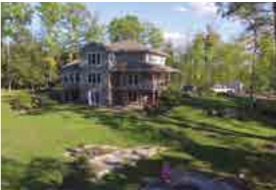
OSPREY ROAD - $649,000

Magnificent flat lot, sand beach with gradual entry, stonework at the shoreline and fantastic N/W exposure. Triple bay garage with storage loft near completion and a classic 3BR cottage to upgrade and finish to your vision.