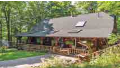
DRAG LAKE Scandinavian scribe 2 bedroom + loft + Bunkie log home. 101 feet of frontage, private south facing lot. 2.5 Hours to GTA. MLS 188256 | $849,500