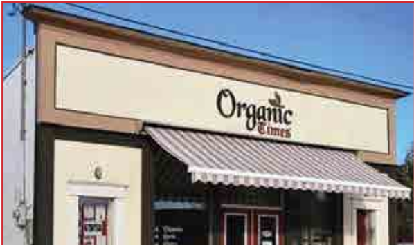
134 Bobcaygeon Road $375,000 Renovated | Street Exposure Open Concept Space