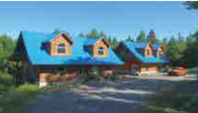
4203 KENNISIS LAKE ROAD Haliburton square log timber frame home w/3 bedroom + 2 baths. Matching double car heated garage and 10 acres. MLS 208792 | $429,000