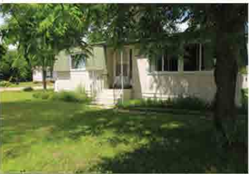
Hunter Creek - $129,000

Prime waterfront lot on Twelve Mile Lake. Catch breathtaking sunrises and big lake views down the lake. Perfect setting to build your dream home or cottage. Accessed via a year round private road & conveniently located less than 13 km from amenities in Minden.