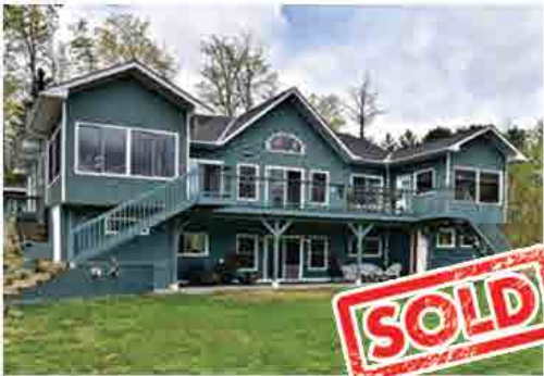
Kennisis River - $675,000

Boat into Halls Lake!! Year round home or cottage with 255 ft on the Kennisis River & boating access to Halls Lake. Bungalow (w/fully finished walkout), 4 bedrooms, office, 2 full baths, main floor laundry, screen room, 48x24 insulated, heated garage w/workshop & storage loft above. Clean swimming. Easy year round access off a municipal road. Custom built in 2009 & shows pride of ownership.