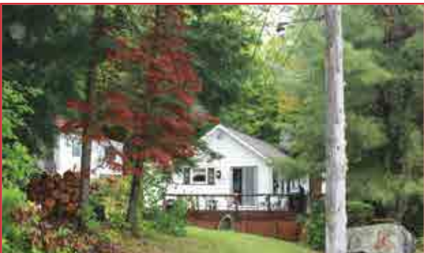
19265 Hwy 35 $245,000 Original 3 season Cottage | 2 Bed 1 Bath Overlooking Kushog