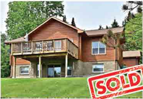
Gull River - $625,000

Boat into Halls Lake!! Year round home or cottage with 255 ft on the Kennisis River & boating access to Halls Lake. Bungalow (w/fully finished walkout), 4 bedrooms, office, 2 full baths, main floor laundry, screen room, 48x24 insulated, heated garage w/workshop & storage loft above. Clean swimming. Easy year round access off a municipal road. Custom built in 2009 & shows pride of ownership.