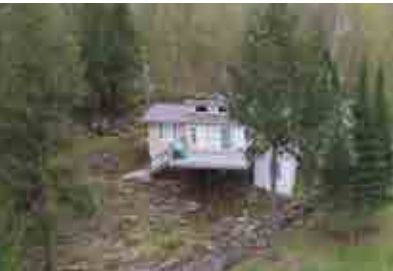
LITTLE BOB LAKE $449,900

Traditional 2BR cottage close to the shore. Beautiful open view, rock & sand shoreline w/deck & dock. Level lot. Well maintained, furnished, yr rnd road. Move in and enjoy!