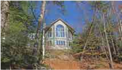
REDSTONE LAKE Executive cottage with 4 bedrooms + 5 baths. Sunny south exp, 166 feet of frontage, extensive docking system. Turn Key! MLS 197077 | $1,900,000