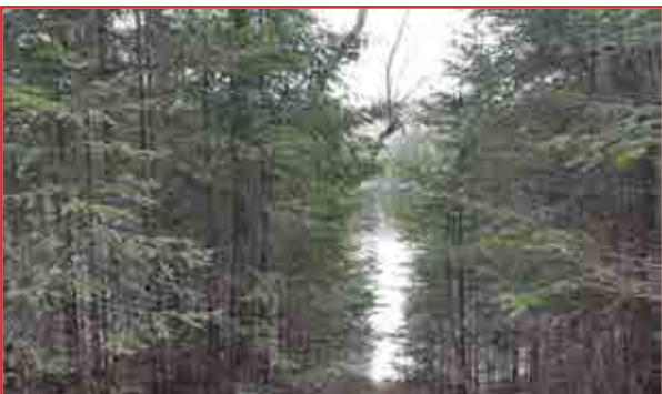
1222 Clark Hill Road $599,000 Cockle Lake Frontage | 127 Acres 3500 linear feet waterfrontage