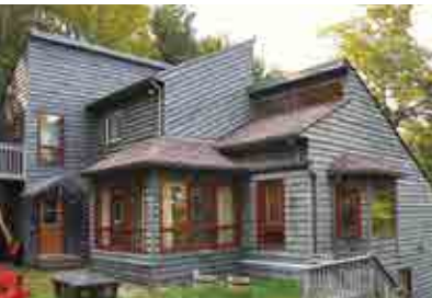
KASHAGAWIGAMOG LAKE $629,000

Great potential here next door to Tim Horton's. Prime location. On town sewers. Engineered fill in place. Official Plan designated Highway Commercial vacant lot.