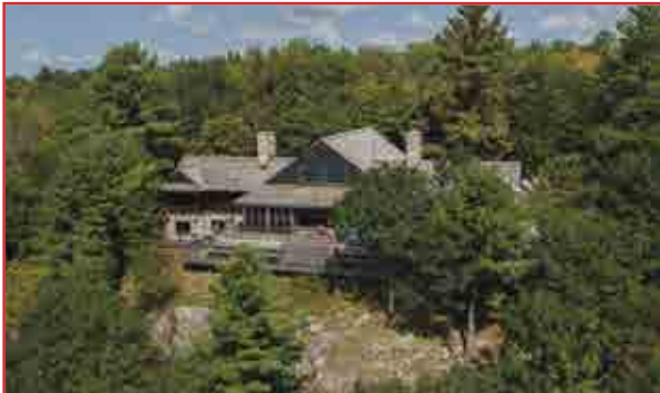
2016 Blueberry Trail Drag Lake $3,999,000 340 ft Lift Inclinator installed | 6 Bedrooms 89 acre waterfront