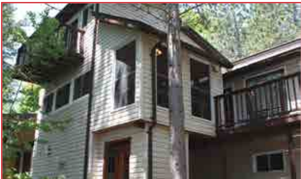
1001 McRae Hay Lake Road $619,000 Family compound | 11 miles of boating 2 Cottages with garages & workshop