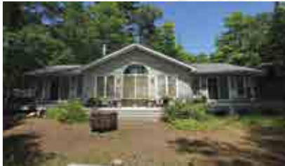
REDSTONE LAKE Welcome to paradise! 3 bedroom + 2 bath cottage. Situated on extremely private lot, gorgeous views W/South west exp. Many recent upgrades! MLS 209069 | $1,499,000