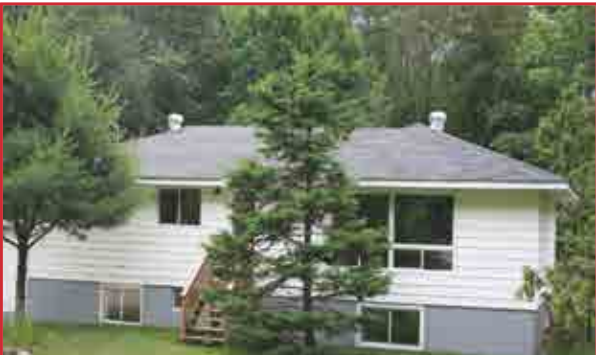
6772 Gelert Road $270,000 3 bed | 1 bath | finished lower level with income potential