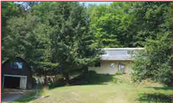
145 Pine Ave $284,000 1.5 acre lot | 3 bed | 3 bath Plus garage & studio