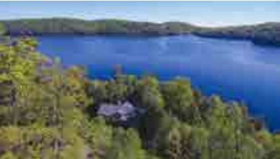
REDSTONE LAKE Cottage with 3 bedrooms + 2 baths. Incredible privacy with 1000 ft of frontage and south west exp & views! MLS 196531 | $1,185,000