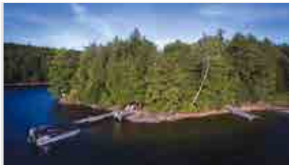
LITTLE REDSTONE LAKE Island retreat with 918 ft of frontage, 2.73 acres, multi exp w/sunsets. 3 bdrm + 2 bath cottage, 20x40 insulated boathouse/bunkie. MLS 191903 | $499,900