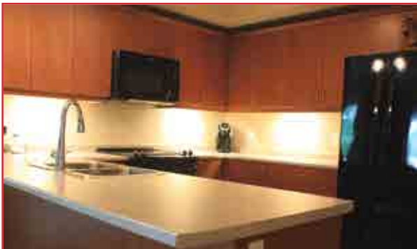
4 Lake Ave, Suite 107 $349,000 First floor Condo | 2 Bed 2 Bath Pride of ownership