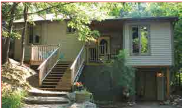
47 Sunnyside Street $349,000 Large Family Home | In town Lifestyle Spacious back yard