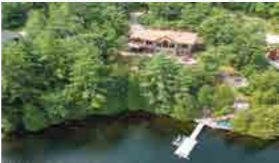
GULL LAKE Stunning family cottage only 2 hours from the GTA. 4 bedrooms, 3 baths, amazing views, incredible landscaping. MLS183450 | $1,699,000