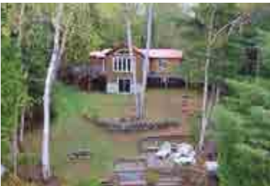
ELEPHANT LAKE $619,900

Professionally styled 4BR/4Bath Home with a VIEW! Call our Team for available details!