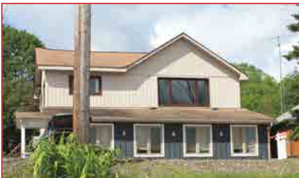
1184 Kashagawigamog Lk Rd $349,000 Overlooking Lake | High Visibility Building Plus Residence