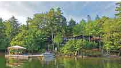
BOSKUNG LAKE 5 Bedroom + 4 bath Situated on 1.66 acres of total privacy, 255 feet of frontage, deep clean water. Heated 3 bay garage! MLS 200271 | $1,345,000