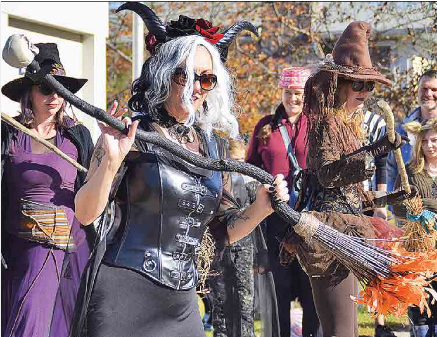
Hali Halloween: The Haliburton Dance Witches kick off the annual Hali Halloween Parade this past Saturday.