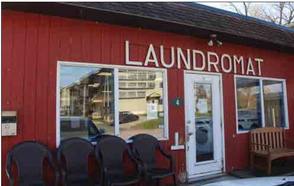
Parkside Laundry suffered $15,000 in damages after a break-and-enter Oct. 22.