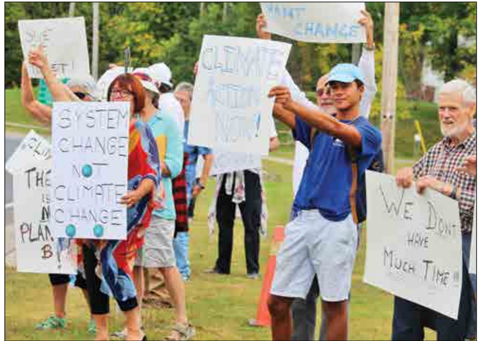
Climate change protesters gather near Haliburton Highlands Secondary School Sept. 20.

“A declaration of a climate change emergency, at the front end of the County’s