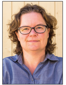
By Lisa Gervais

For now, the public has to think about what it wants. Can they live with the status quo or do they want change and what are the costs?