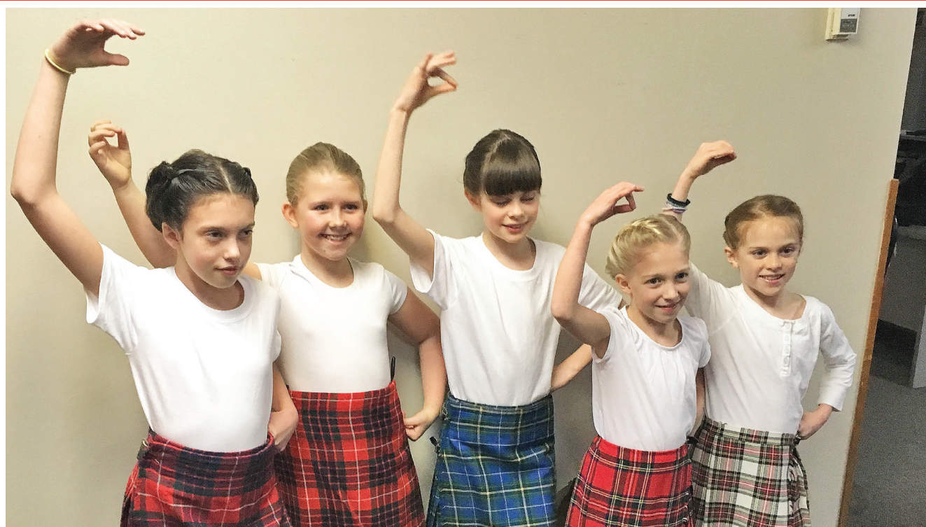
Highland dancing is expected at Robbie Burns night.