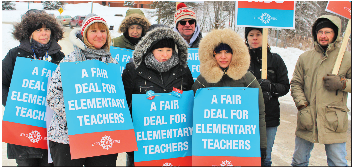
Elementary teachers braved the cold for a strike outside J. Douglas Hodgson Elementary School Jan. 21.

To Register and Find Out More: 705-457-4700 www.haliburtonchamber.com