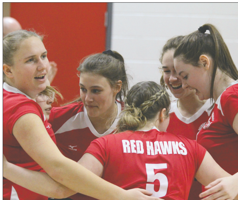
The Haliburton Red Hawks junior girls teams embraces in the midst of a set at Haliburton Highlands Secondary School Jan. 13.

Kawartha qualifying games start Feb. 11.