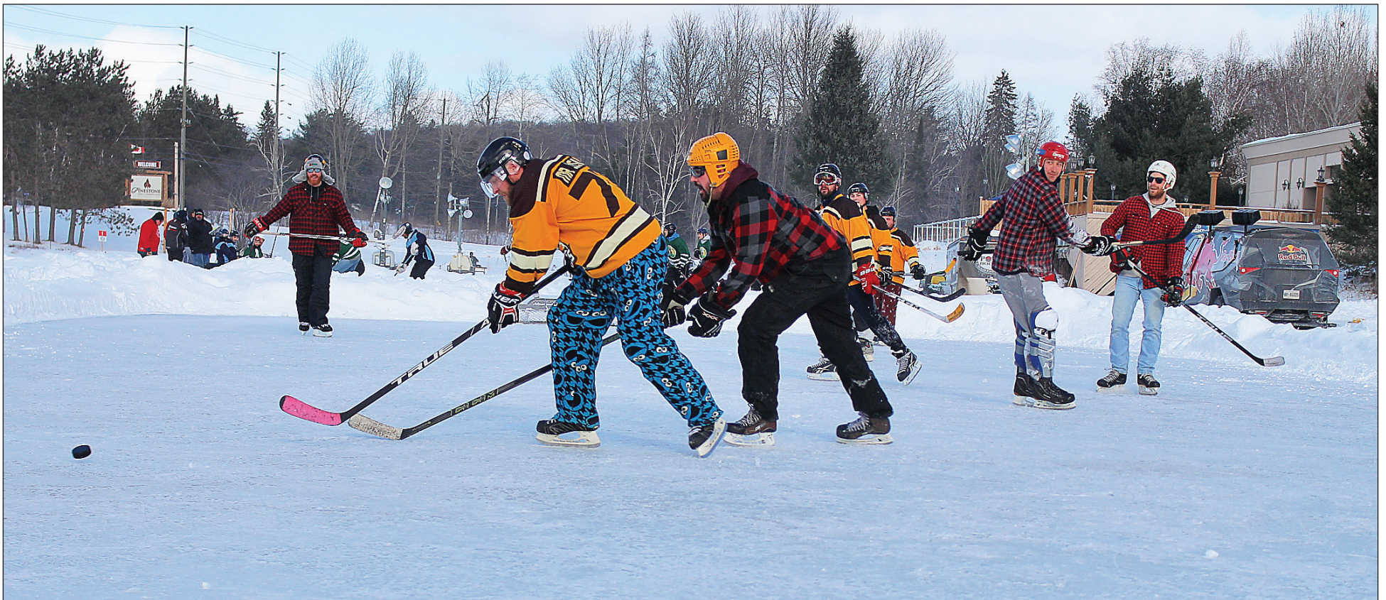
Weather has been challenging for organizers readying for the Canadian National Pond Hockey Championships. File photo.