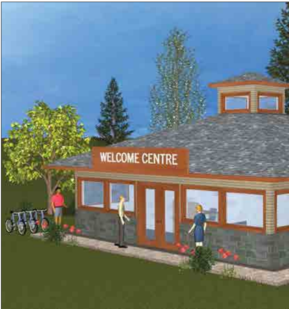
Head Lake Park: Proposed Building and Associated Arrival Plaza. From Basterfield and Associates. Dysart et al council agenda. Submitted.