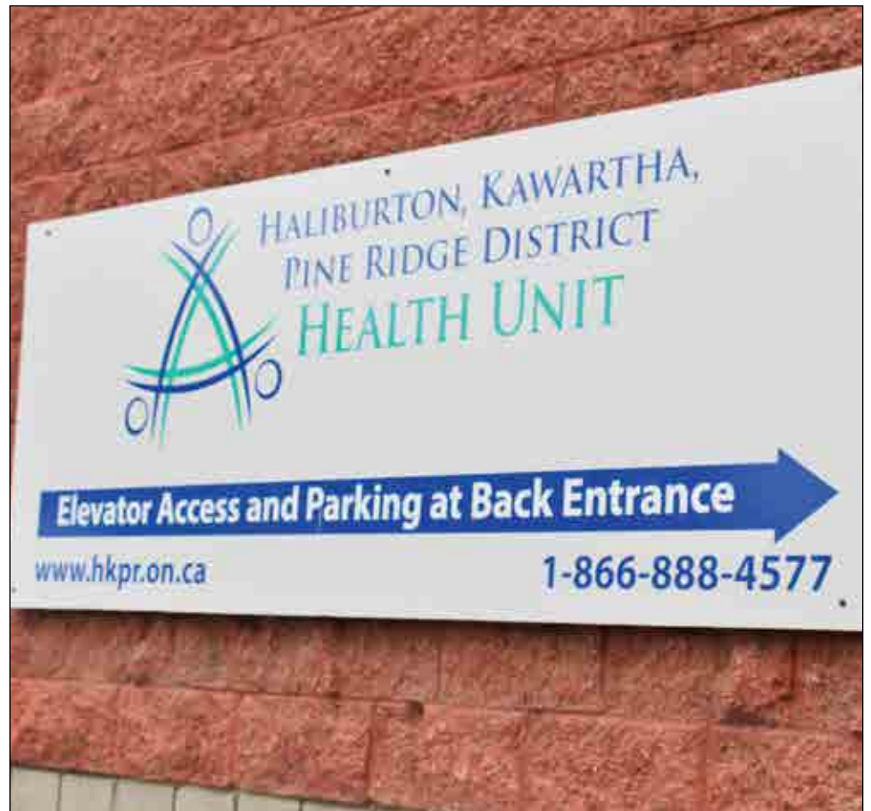
The Haliburton, Kawartha Lakes, Pine Ridge District Health Unit Board of Health has said the County could be in arrears if it does increase its funding. File photo.