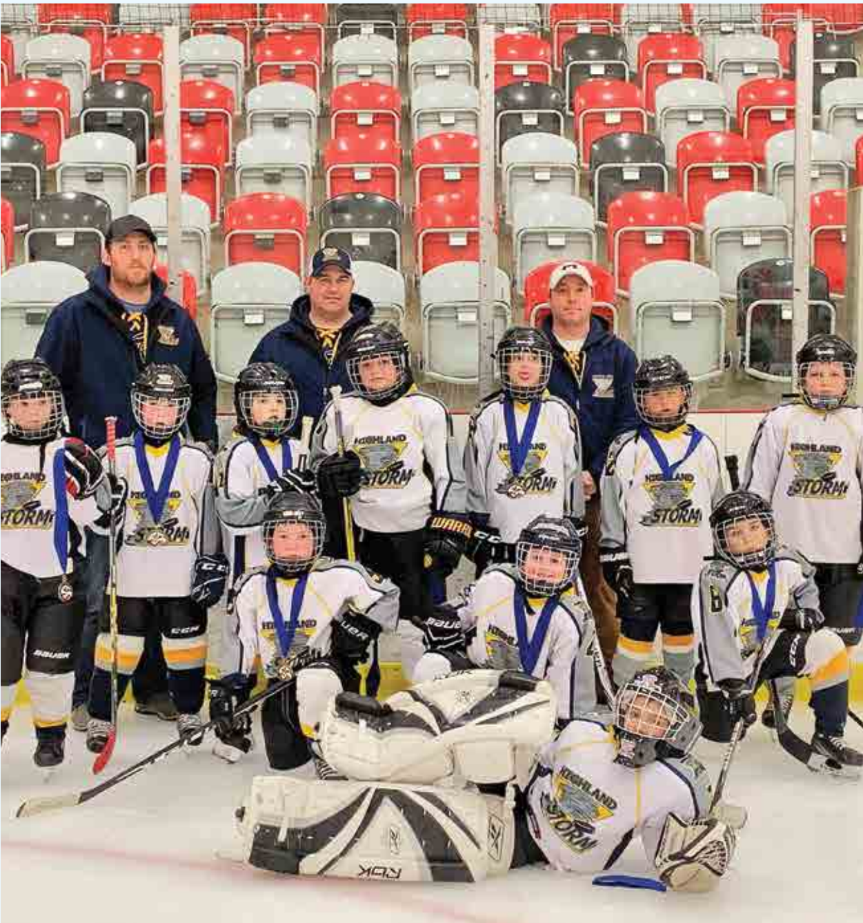
The Novice LL team pictured with their silver medals. Photo submitted.