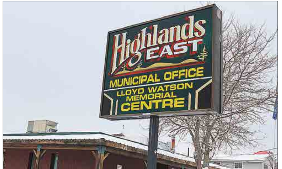
Highlands East is planning a 3.85 per cent levy increase in its draft budget. File photo.

Hunter said the bigger recommendations would have to wait until after the