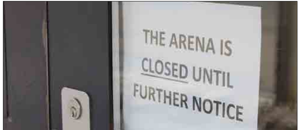
The A.J. LaRue Arena is one of many municipal facilities closed due to COVID-19.

community centres, including those in Stanhope, Dorset and Oxtongue Lake. All programming and events at these facilities are cancelled. The airport terminal building and water trails office are also closed.