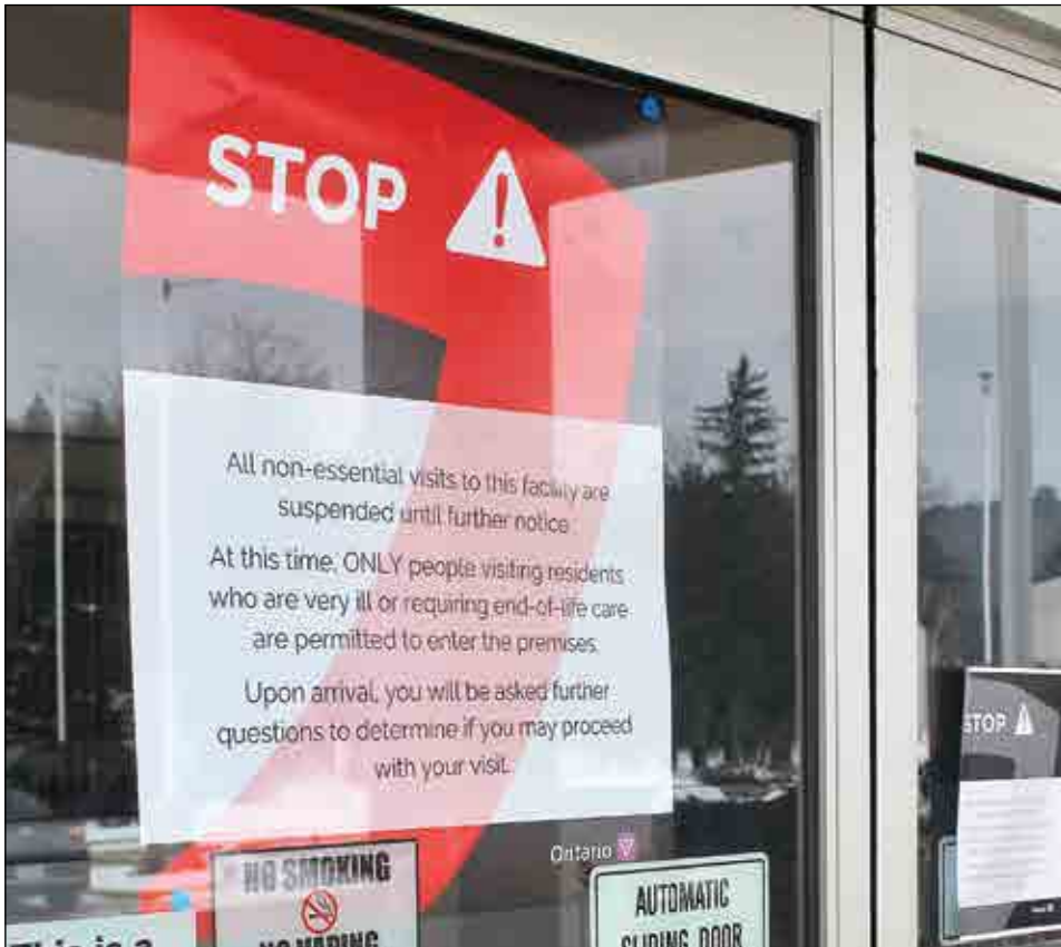
Health partners have issued a joint media release telling people what to do in the event they think they have COVID-19.