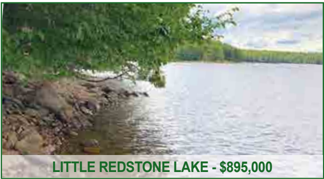
LITTLE REDSTONE LAKE - $895,000

Beautiful building lot on prestigious Little Redstone Lake! This well treed, very private property features 5.7 acres and 930ft of clean rock and sand shoreline. Exceptional sunrise views with clean deep-water swimming. Driveway is installed and potential building site is cleared. Bring plans for your retreat and begin the dream today!