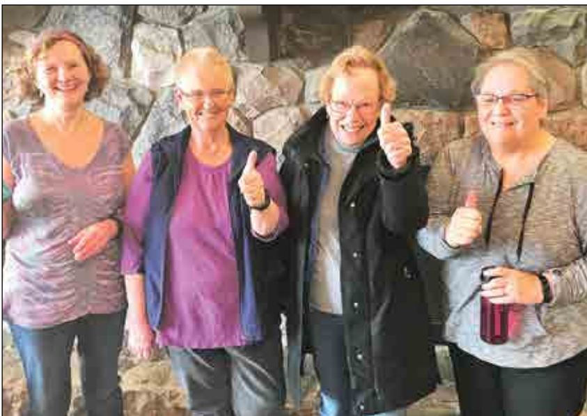
The Wilberforce walking group.