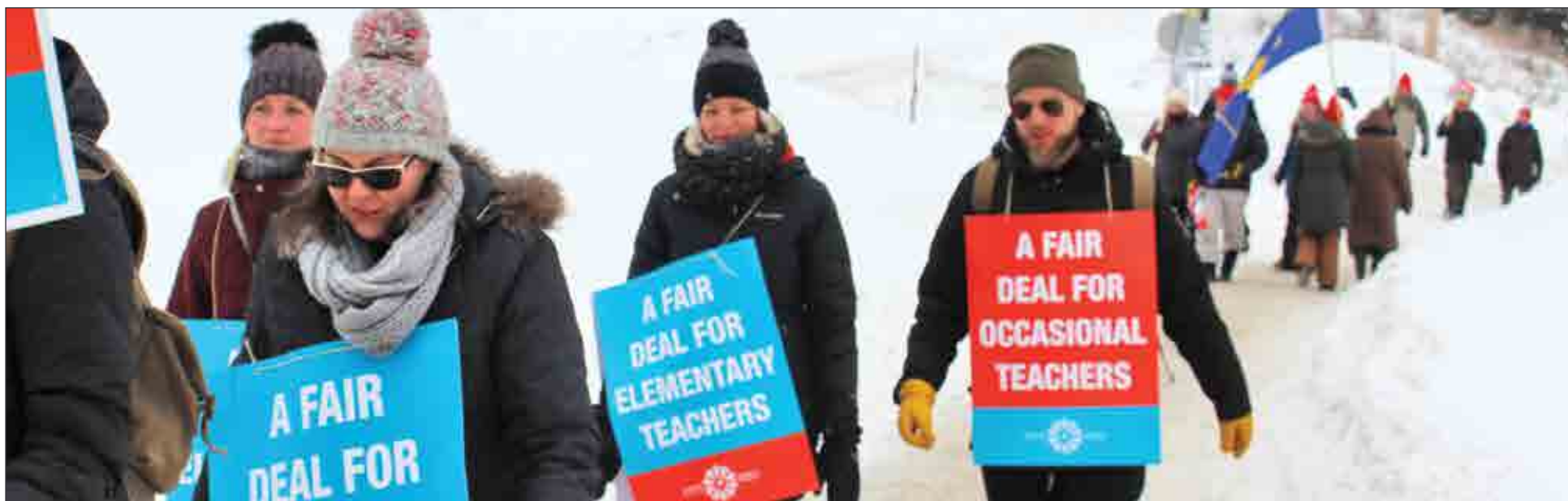
The Elementary Teachers' Federation of Ontario is halting job action after reaching a tentative deal with the province. File.