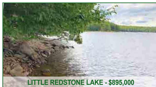
LITTLE REDSTONE LAKE - $895,000

Beautiful building lot on prestigious Little Redstone Lake! This well treed, very private property features 5.7 acres and 930ft of clean rock and sand shoreline. Exceptional sunrise views with clean deep-water swimming. Driveway is installed and potential building site is cleared. Bring plans for your retreat and begin the dream today!