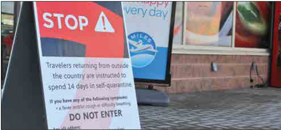
A sign placed outside Haliburton Foodland, part of measures the grocery store is taking to protect against the spread of COVID-19.

HOME • AUTO • LIFE • INVESTMENTS • GROUP