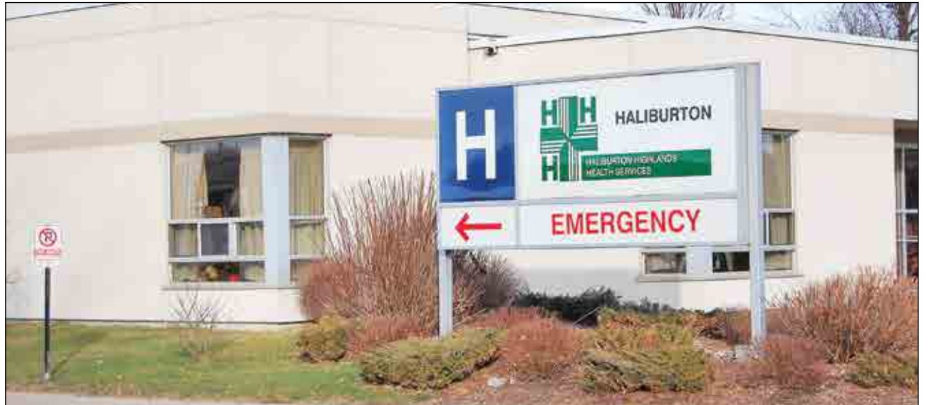
HHHS has put out a call for staffing help.

It is important for the public to know that not everyone will be tested. Local health service partners continue to build testing capacity locally and will provide more information as soon as it becomes available. (Lisa Gervais)