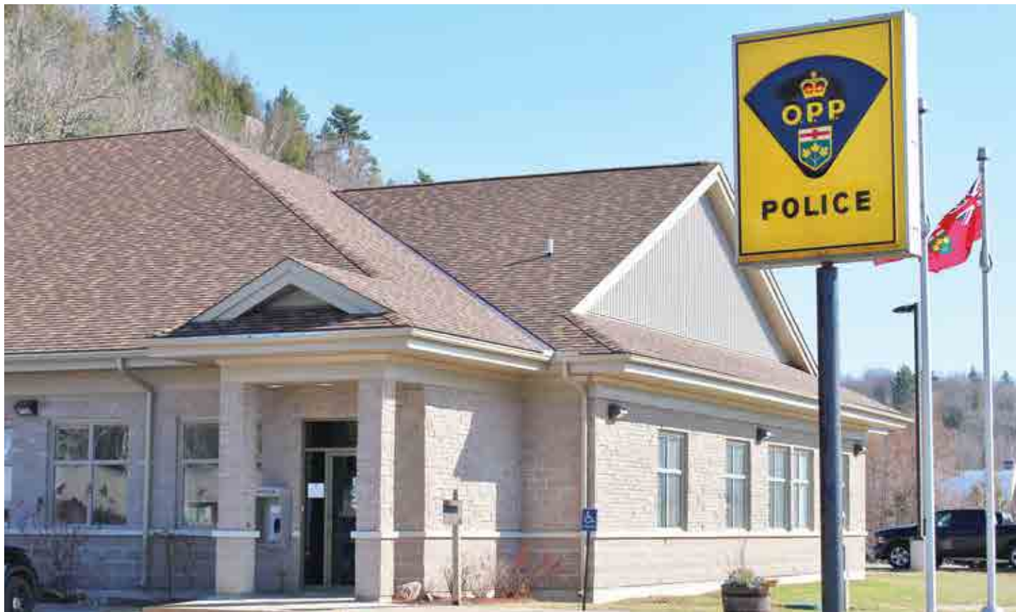
OPP executed warrants on April 9, arresting and charging five people with drug-related infractions. File.

Pending the outcome of the ongoing police investigation, the animals have been placed in quarantine outside of the community by order of the health unit.