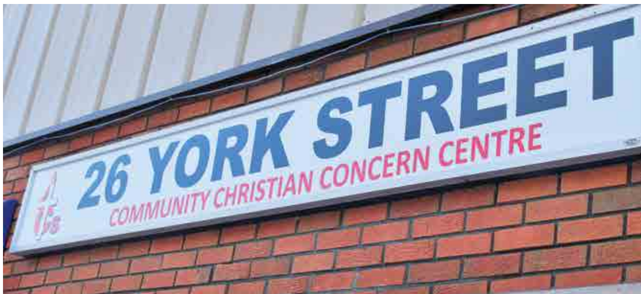
Local food banks are managing with an increased demand during COVID-19. File photo.

Follow The Highlander on Facebook for the latest updates: Facebook.com/TheHighlanderOnline