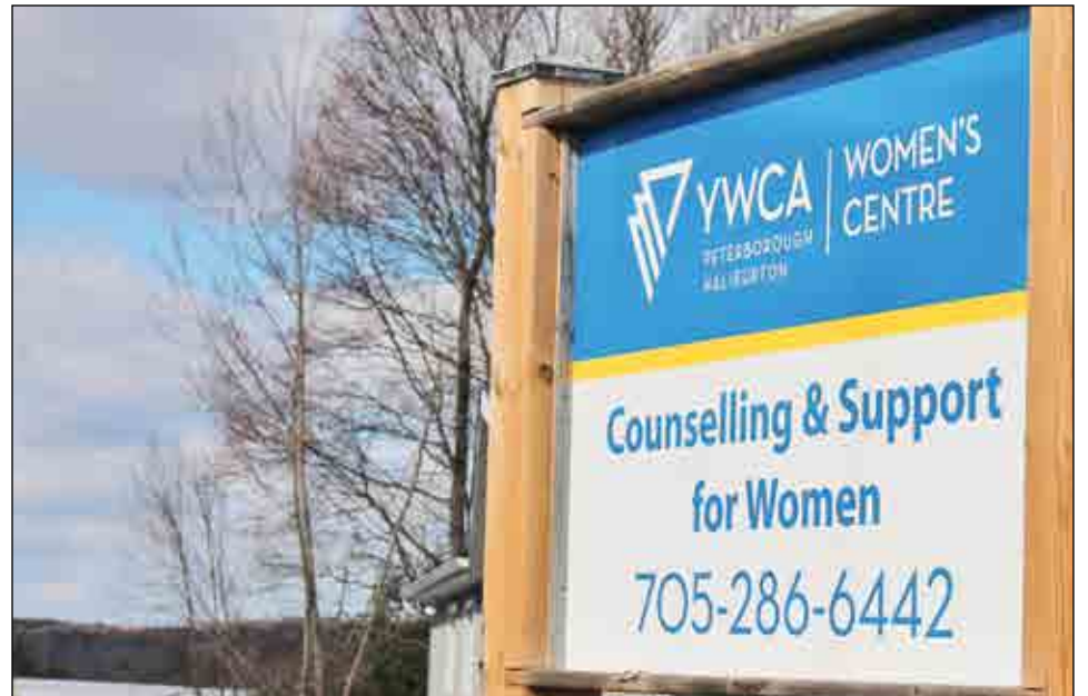
The Haliburton Emergency Rural SafeSpace continues to operate during COVID-19.

Their offices are closed to the public and staff who usually work at their Simcoe Street office, Women's Centre of Haliburton County and Centennial Crescent Housing Community are working remotely and will