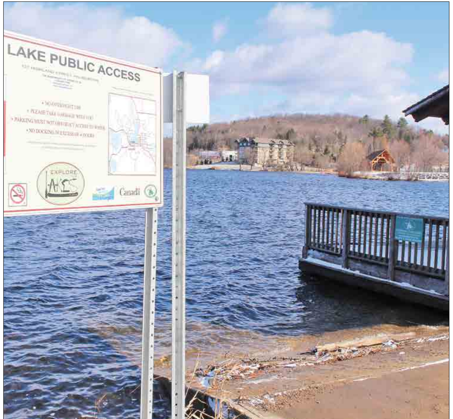
Local municipalities are keeping boat launches open for now despite some concern about potential abuse.