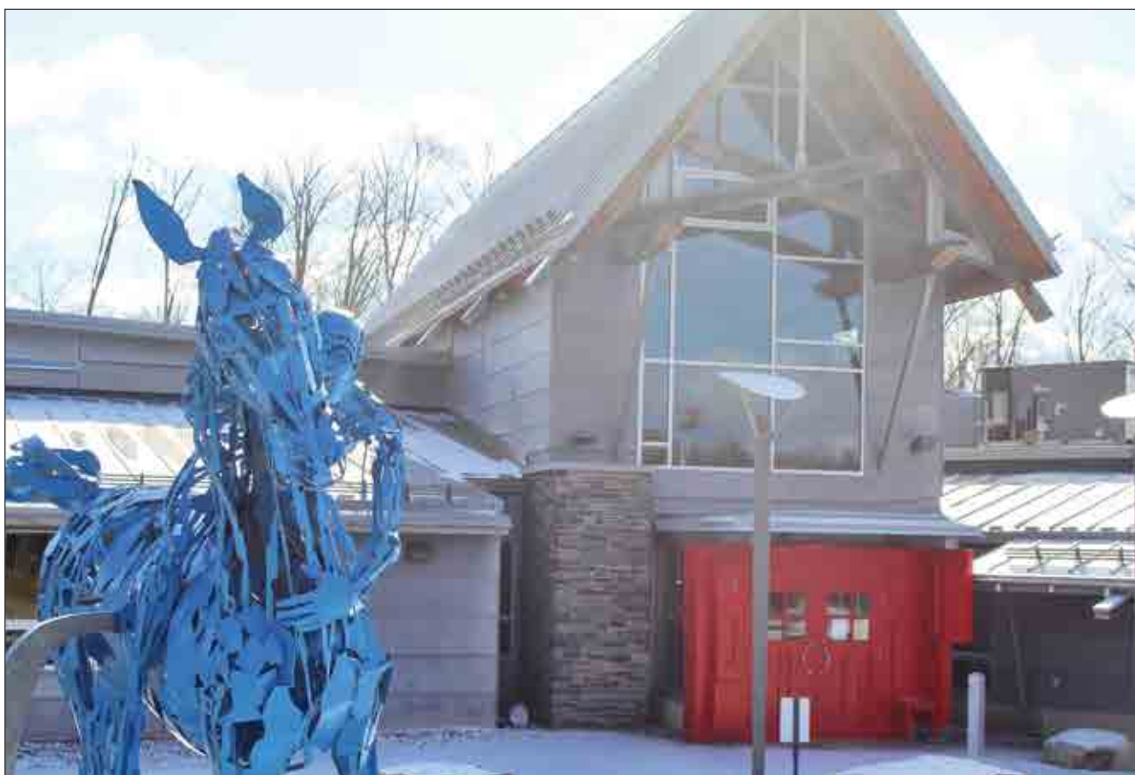
The Haliburton School of Art and Design will not run its summer programming this year.