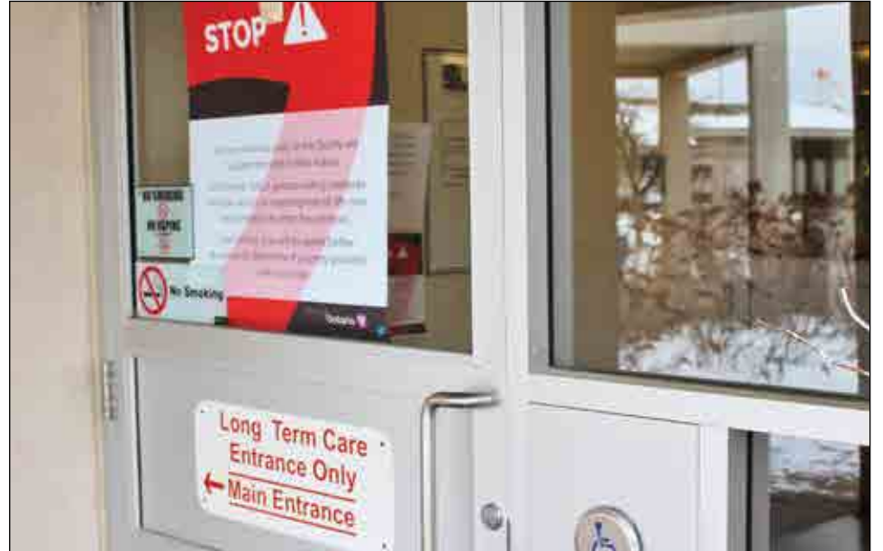
Highland Wood and other long-term care homes are limiting entry. File photo.

"Our homes are set up a bit differently from Pinecrest Nursing Home. We have the ability to separate and isolate residents if the need arises," she said.