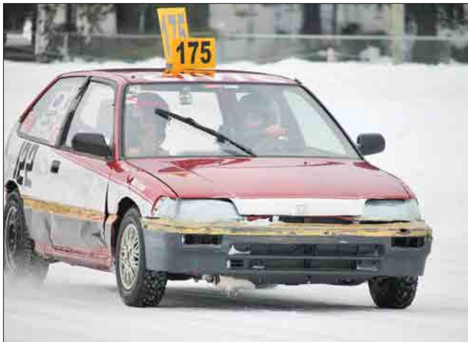
The ILR Control School has shared the Minden fairgrounds. File photo.

Law said they take their COVID safety protocols seriously and have run their car control courses in the GTA with strict protocols in place. He said they have reduced the number of participants to ensure social distancing in the classroom. Everyone must wear masks at all times and sanitization stations are set up and utilized often. They have hired a dedicated COVID