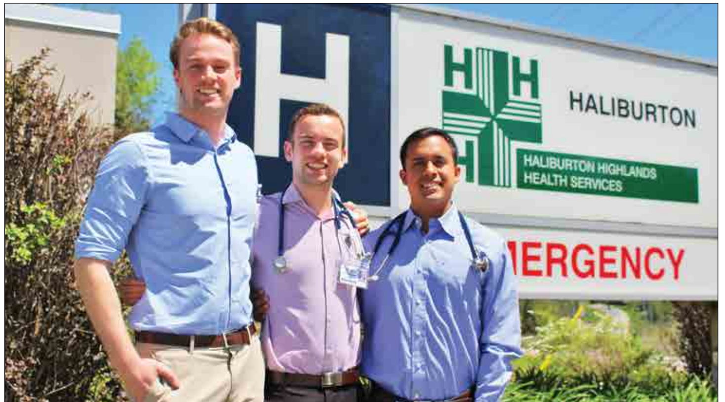
Medical students visited Haliburton in the summer of 2019 through the Rural Ontario Medical Program. The County is expanding its doctor recruitment program. File photo.