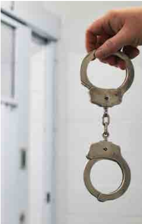
An officer holds handcuffs in front of a cell at the Haliburton OPP detachment.