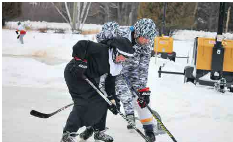
The Canadian National Pond Hockey championships. File photo.