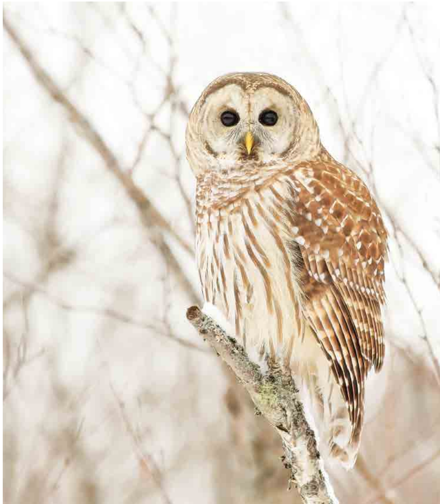
Tammy Nash captured this image of a barred owl at the back of her property in Algonquin Highlands.

Many local organizations have promoted the importance of deep rooted, native vegetation to control erosion, absorb phosphorus that inevitably gets washed into the lake from septic systems, even when they are operating as designed.