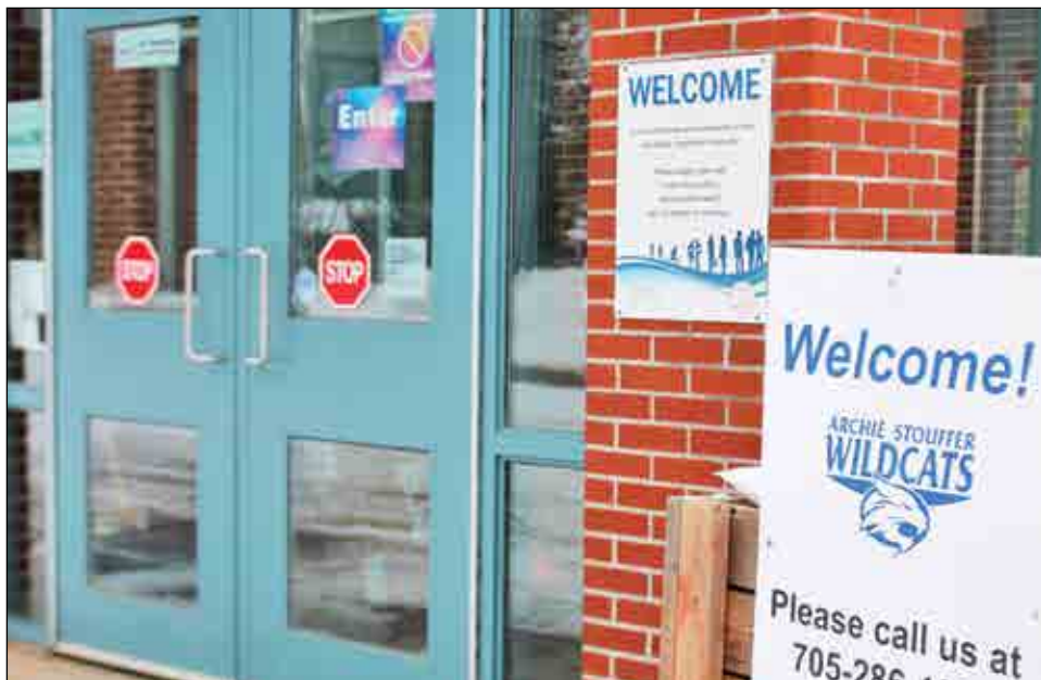
Archie Stouffer Elementary School in Minden remains shuttered after the holiday break.