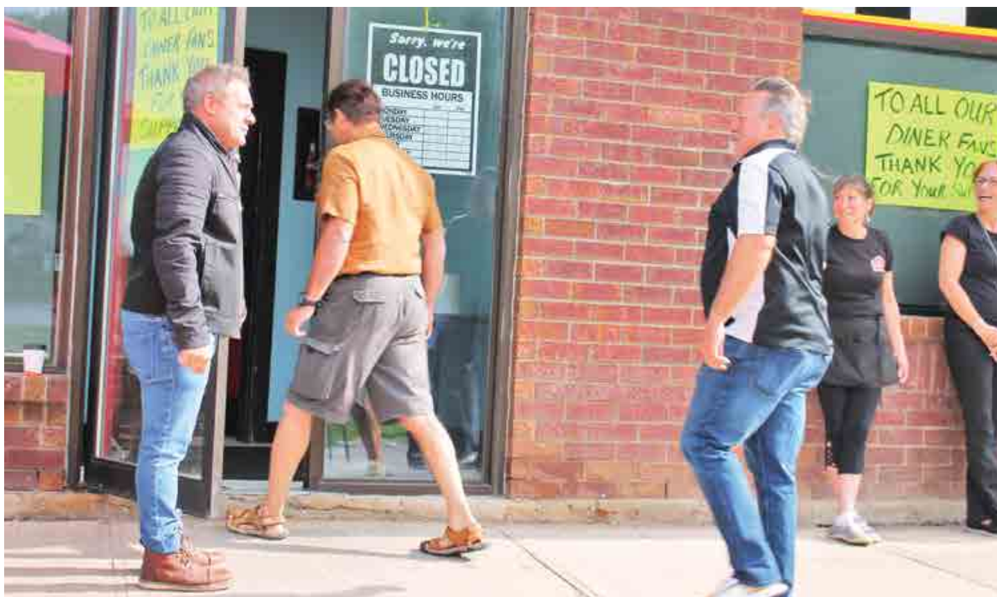
The 50s Diner in Minden briefly opened during lockdown. File photo.

HOME • AUTO • LIFE • INVESTMENTS • GROUP