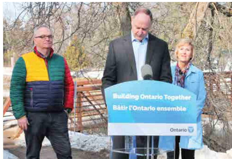
The province announced a flooding strategy in Minden. File photo.