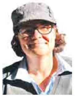
By Lisa Gervais

The Highlander has been looking into the drug problem in the County over the past year and today launches a Highlander Investigates series on the front page.