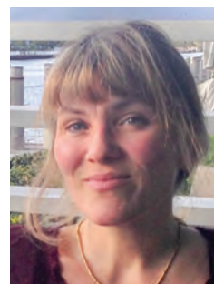
By Dr. Nell Thomas

A: People are asked to continue to follow the public health measures (six feet apart, avoid indoor groups, double mask, hand hygiene). Avoid socializing with people from other households for now. Watch for updates from public health as infection rates and vaccination rates are tracked and will dictate safe activities for all of us.