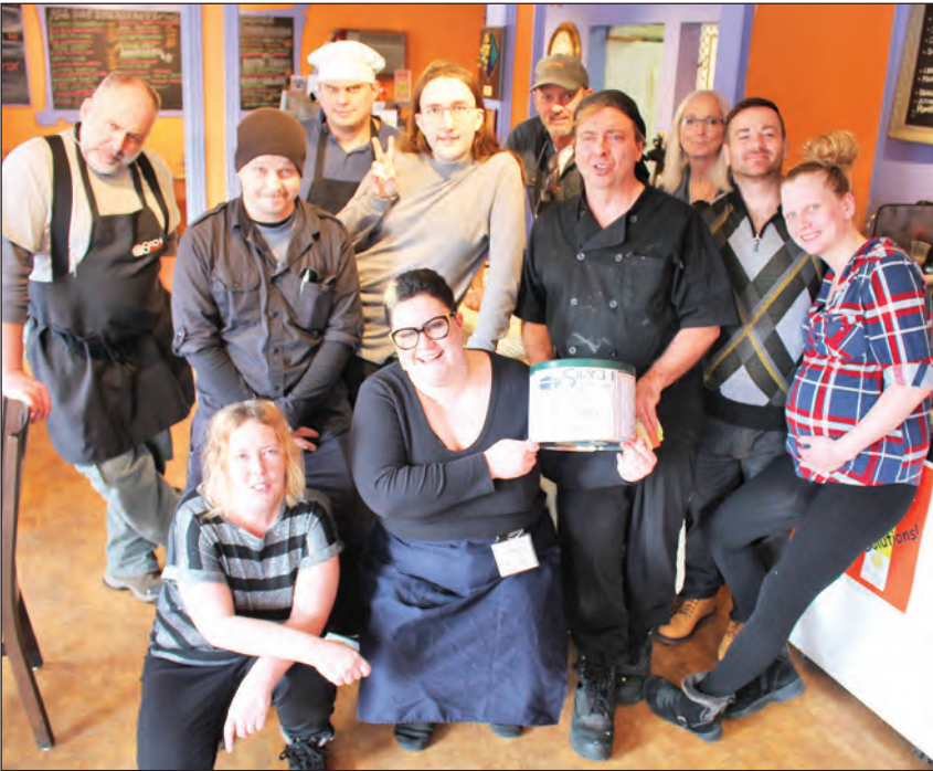
Past participants in a Cook It Up program, prior to COVID-19, which is why they are not wearing masks or social distancing. File.

“We can help you solve any practical issues that may stand in your way, like if you don’t have transportation, or need to be home when the kids get off the bus. And you’ll get a hot lunch any day you’re on site.”