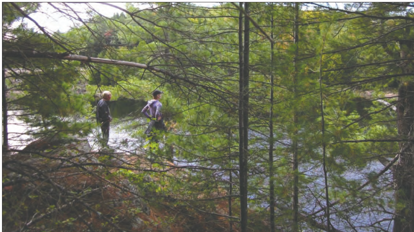
Highlands East will head a public consultation for the province's disposal of Crown land on Centre lake.

For more information: www.haliburtonchamber.com