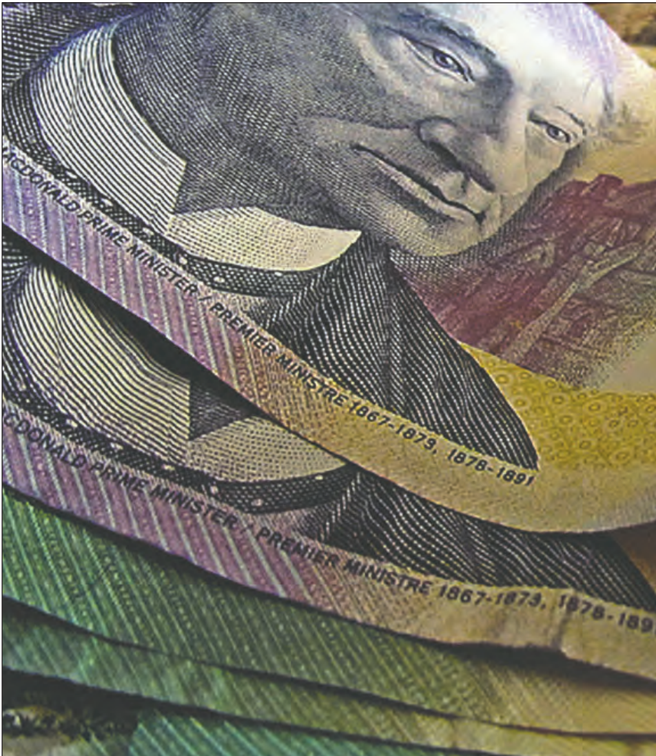
Highlands East passed its budget March. 2. File photo.