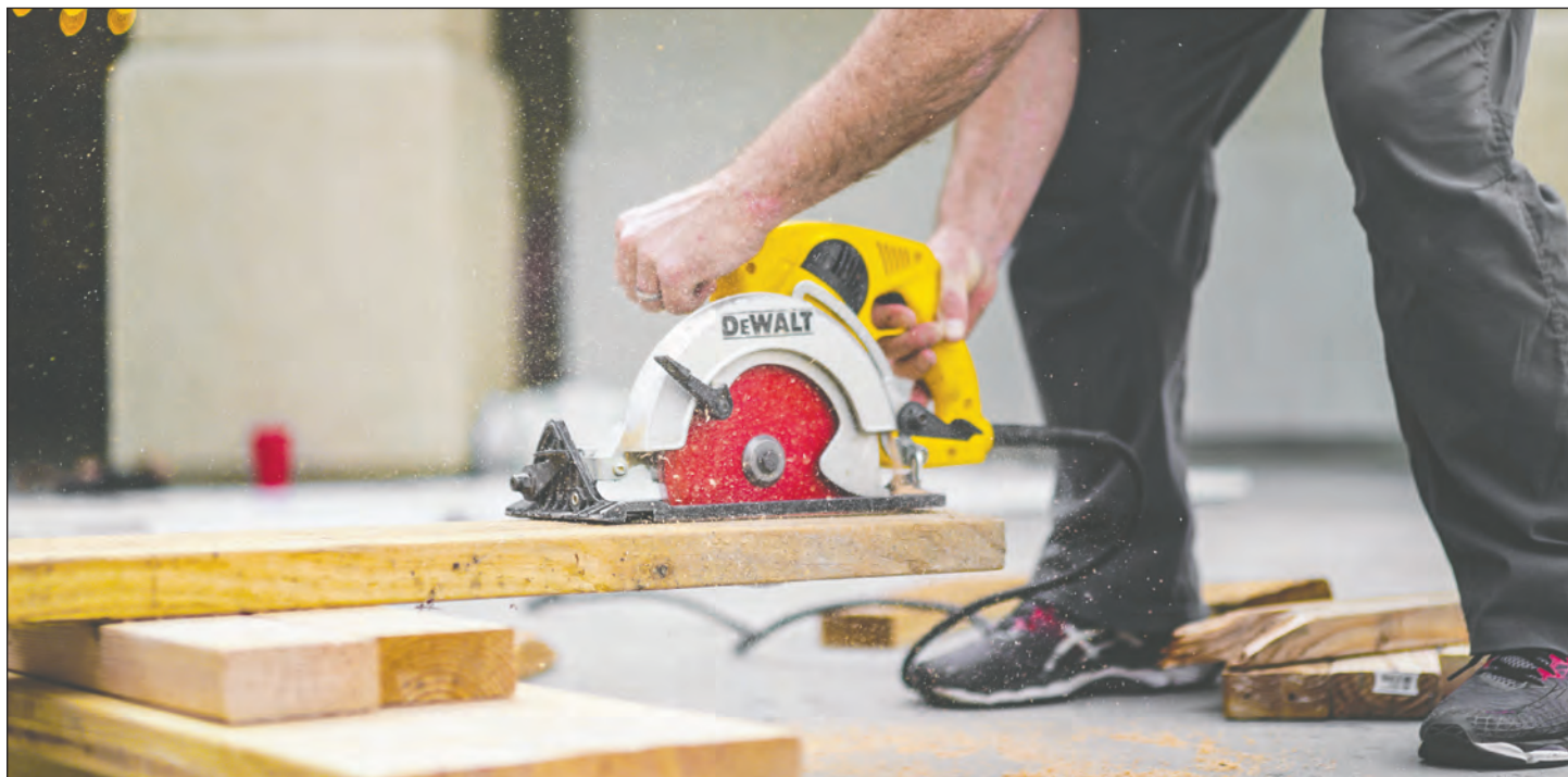
Carpenters are one of the in-demand skilled trades.

It promised students long-term career opportunities, the chance to own their own business and portable skills that could allow them to work anywhere in the world in any of the 140 recognized trades offered in Ontario.