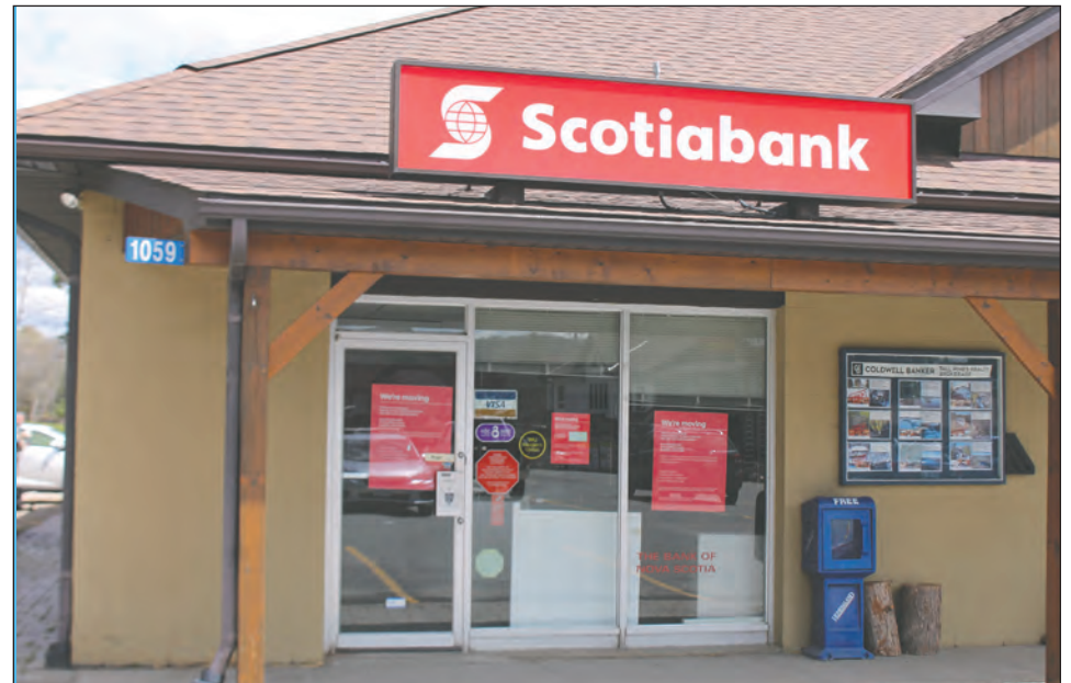
The Scotiabank in Dorset is being officially moved to Huntsville effective Oct. 19, 2021.

“It is tremendously unfortunate, because the bank is one of the things that gives the