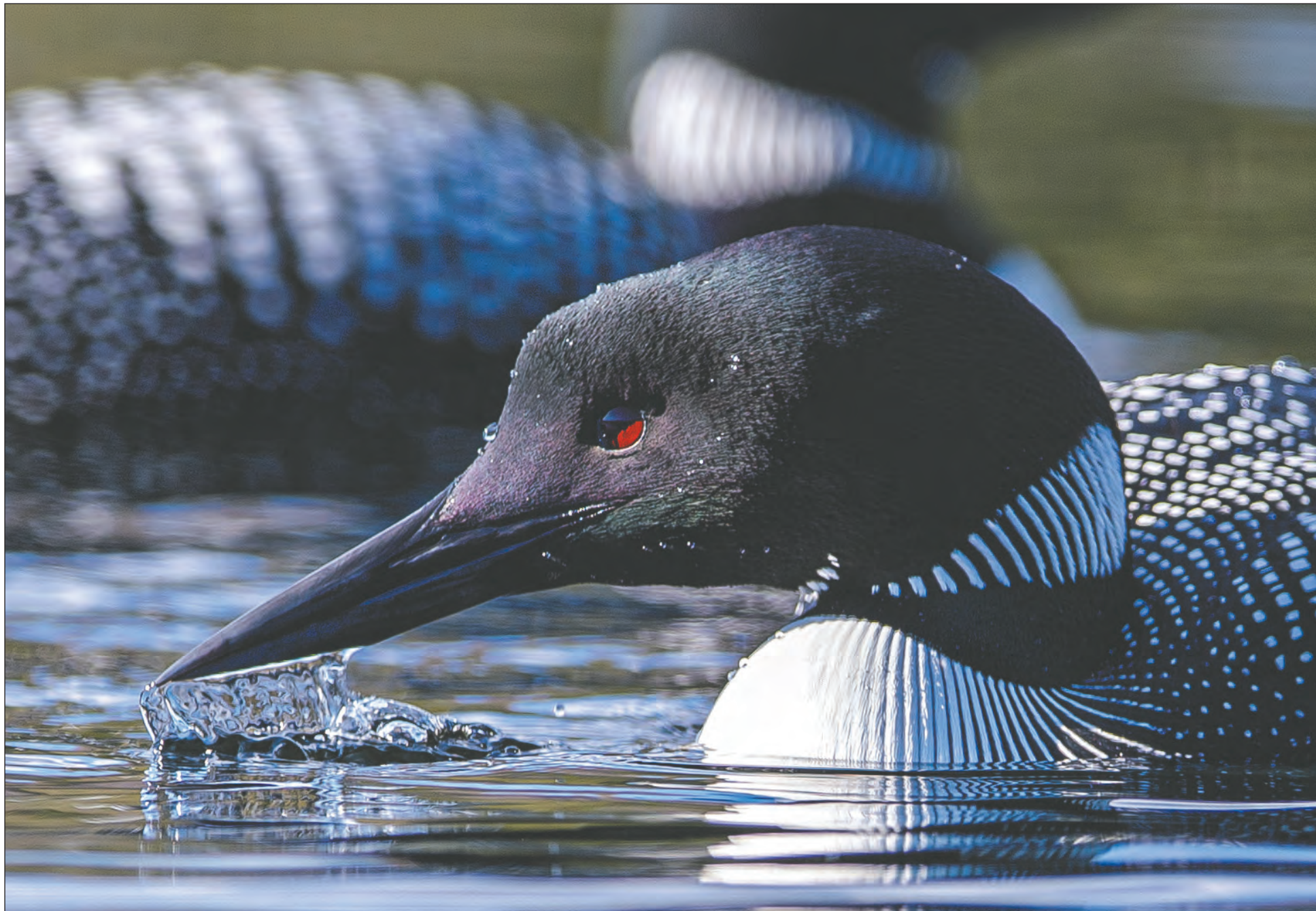
Kevin K. Pepper captured the Common Loon creating what he calls 'The Water Fall.'