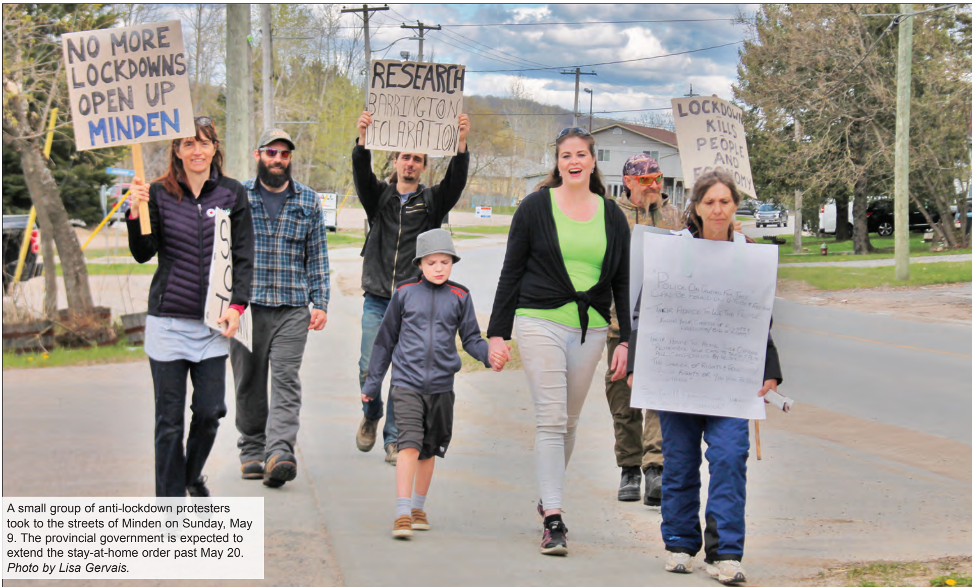
A small group of anti-lockdown protesters took to the streets of Minden on Sunday, May 9. The provincial government is expected to extend the stay-at-home order past May 20.