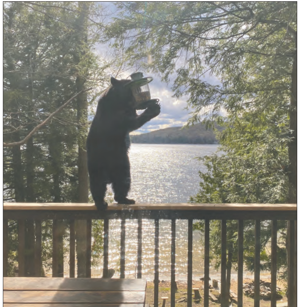
This black bear wandered onto the Campbells’ deck looking for food from bird feeders.

If a bear is posing an immediate threat by exhibiting threatening or aggressive behaviour, remain calm and call 911 or your police department.