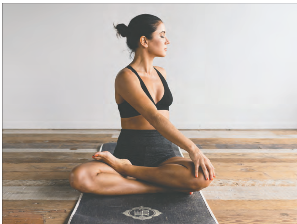
Yoga could be part of the YWCA challenge.