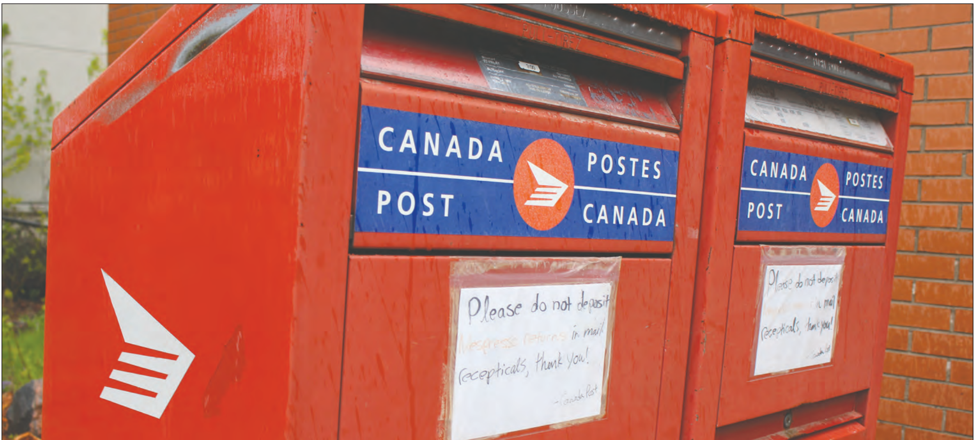
Algonquin Highlands opted for internet and telephone voting in 2022.