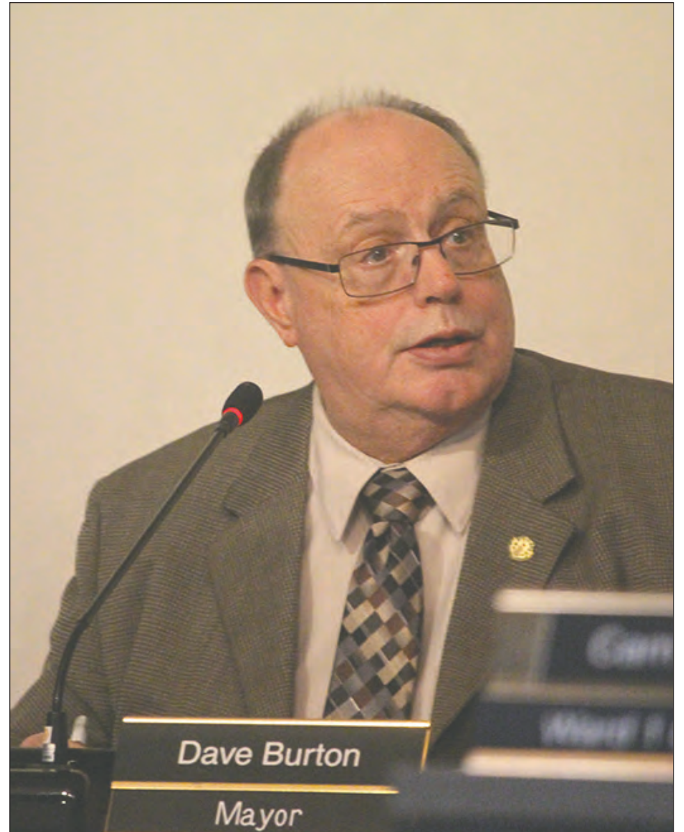
Highlands East is joining other townships to use internet/phone voting in 2022. File photo