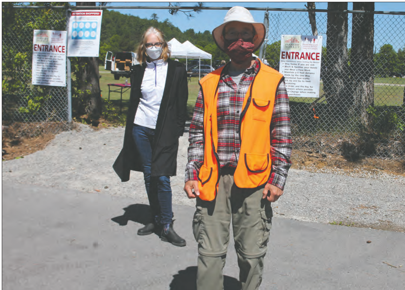
Farmers markets are returning to Haliburton, Minden and Stanhope. This photo was taken at last year's COVID-appropriate market in Minden. File.

"We would like to thank all the vendors for participating. We want to wish them a very enjoyable market season. People can expect to see all the traditional vendors that appeal to them, ones that are regular vendors are going to be returning, and we'll have a few new ones."