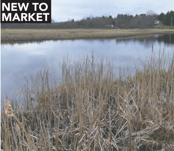
VACANT WATERFRONT LOT Gull River | Hwy 118 $149,000